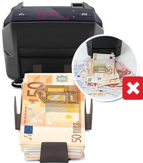
Moniron Dec Ergo | Automatic currency detector